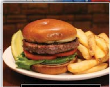
BACON CHEDDAR BURGER