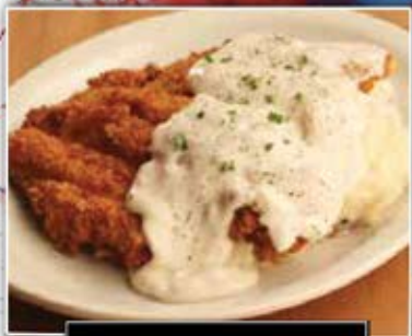
COUNTRY FRIED CHICKEN